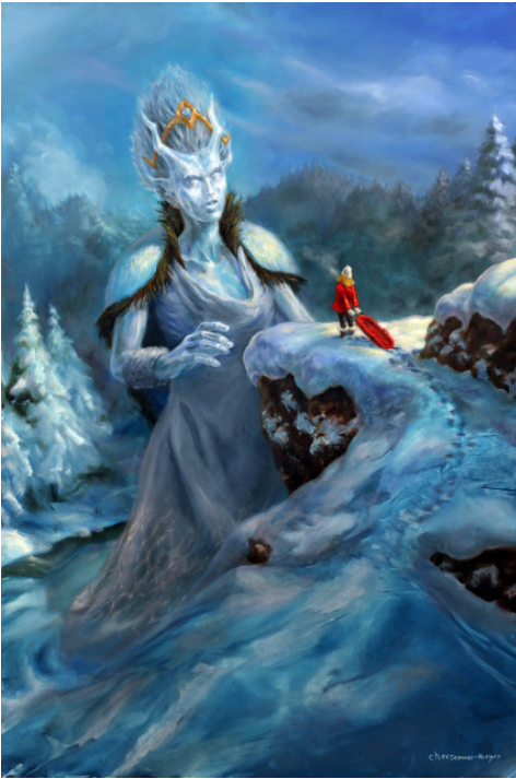
Winter's Daughter , 2013 Oil on panel 24"x36" $1820