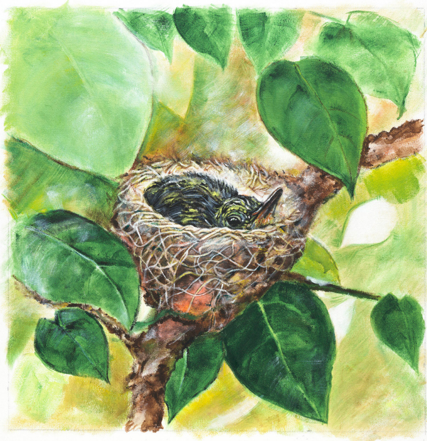
Peek , 2013 Acrylic on canvas 24"x24" $995