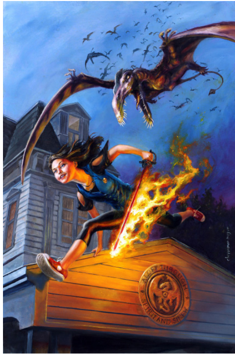
Spirit and Sinew , 2012 Oil on panel 18"x27" $1400