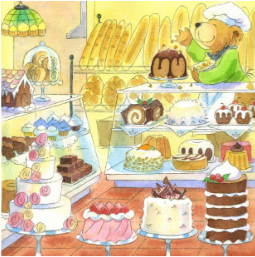
Stella Bakes Cakes , 2013 Pencil and watercolor 8"x8.25" Not for sale