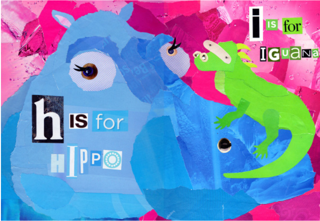
Animal ABCs, 2012 Collage 11"x16" Not for sale