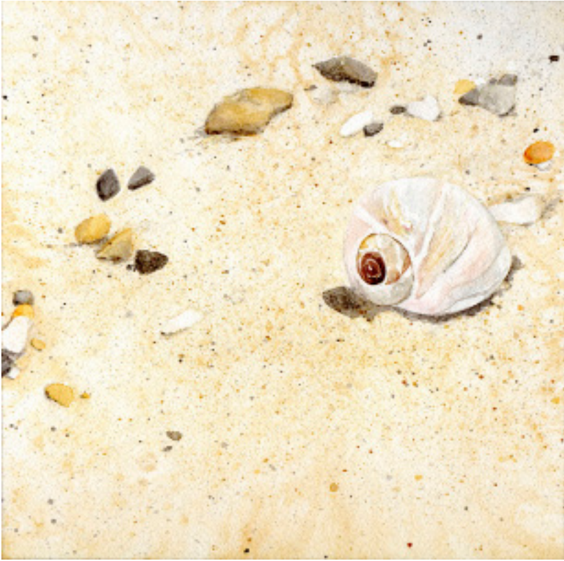
Northern Moon Snail , 2009 Watercolor 8"x8" Not for sale