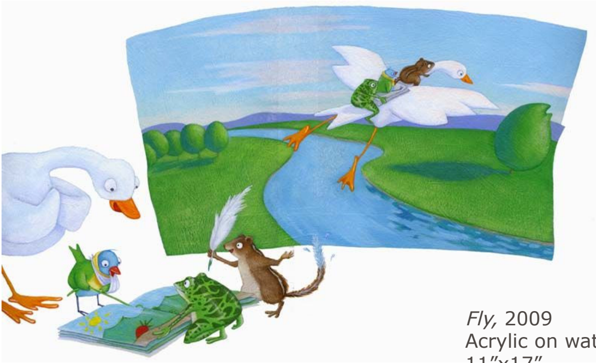
Fly , 2009 Acrylic on watercolor paper 11"x17" Not for sale