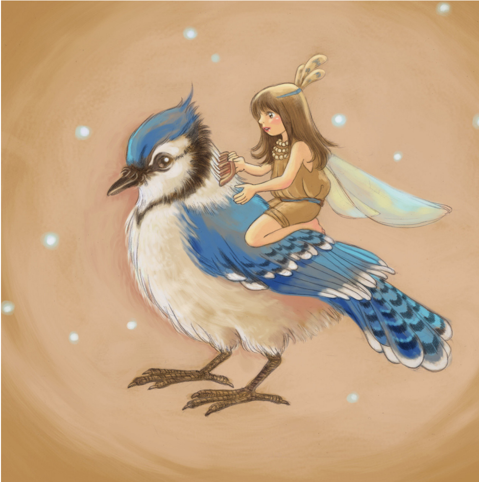
Child of Wind , 2013 Charcoal on paper; Digital color 10"x10" Not for sale