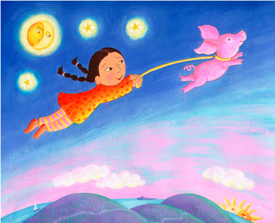
Paloma's Pig Can Fly! , 2009 Gouache and colored pencil 14"x17" Not for sale