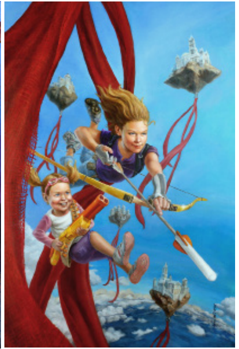
Adventure Girls , 2011 Oil on panel 24"x36" $1800